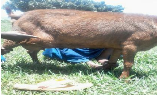
1. Hernia in pregnant goat in Endulen, Ngorongoro