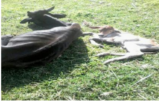
3. Rabies suspected cases confirmed to be ECF at Endulen, Ngorongoro