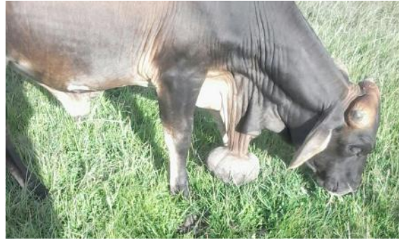
2. Cervical neck outgrowth in a cow in Oloirobi, Ngorongoro