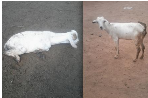
4. PPR cases in goats in Malambo, Ngorongoro