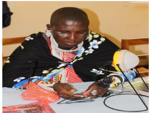
A CHR charging her mobile device using solar charger