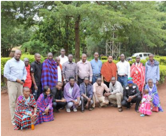
SACIDS digital technology specialists with community health reporters in Ngorongoro

with first aid kits to provide immediate health care support to community. In addition to training, the CHRs group network was established using WhatsApp to facilitate sharing of experience and challenges resolutions amongst themselves, and with health specialists. Furthermore, SACIDS addressed some of the challenges experienced during the initial phase of the programme including provision of solar chargers to CHRs to facilitate charging the mobile phones in their remote locations where there is no alternative power source.